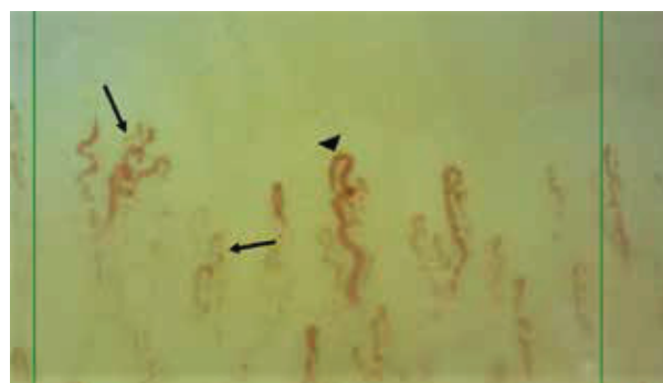
Figure 2. Nailfold video capillaroscopy ×200 showing capillaries with disrupted flow of red blood cells, flowing one by one, rolling (arrows), in contrast to the normal distended capillary (arrow head)

NVC is an available, easy-to-use, diagnostic tool that enables clinicians to inspect the microvasculature, intravitaly. The use