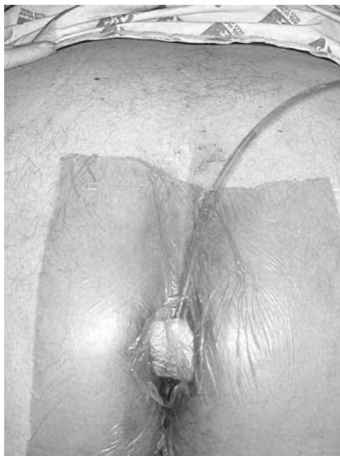
Figure 3. The whole area is covered with adhesive drape, creating an airtight seal.

to 31 days (mean length 22 days). Negative pressure treatment ranged from 2 to 30 days (mean of almost 12 days).