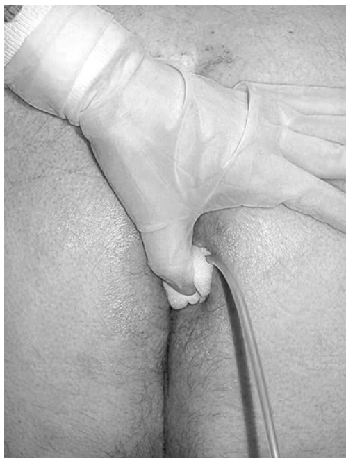
Figure 2. Evacuation tube is placed over the sponge, and covered with a second sponge layer.