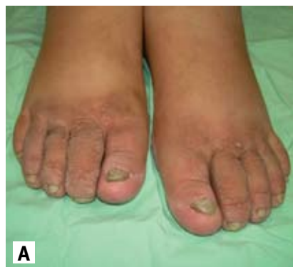
[A] Bilateral leg edema with verrucous thickening of the toes. The nails show dystrophy, thickening, yellow discoloration and overcurvature.