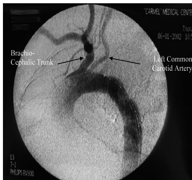
Figure 2. Completion angiography after endovascular treatment. The orifice of the left subclavian artery was covered and occluded by the stent graft.

graft deployment as well as late complications such as endoleaks and dislocations. In addition, follow-up (average \pm SD 32 \pm 15 months) included blood pressure measurements of both arms at rest, after effort (repetitive arm lifting) [13] and pulse palpation, and vertebral artery blood flow by duplex (direction and velocity).